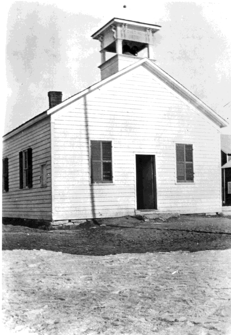
District #10 school at Marshville, NY

It laid out the Central School District which would be the death of one room country schools in our area. Now only the Amish schools remain as a reminder that once there was a much different education system.